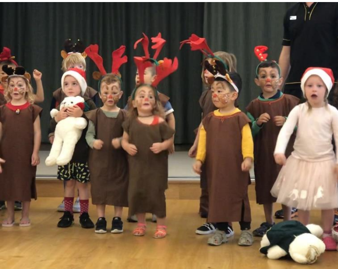
Albany Pre-School Performance Thank to everyone who came along to support Albany preschool. Weren't the kids just precious!

Some of you may have noticed a guest currently staying with Odette.