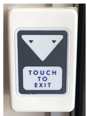
Gary Jarvis Village Manager

When exiting the lodge through this door you will see an automatic door open button on the left-hand side, the same style as the one on the main lodge door.