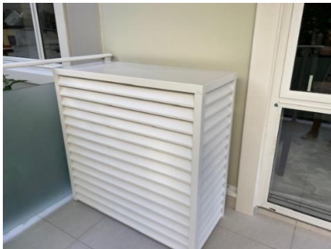
Standard top $1131.85 includes installation and gst

Their website is http://www.heatpumpcovers.com/products