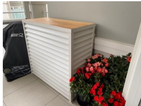
Premium top $1331.85 (top hardwood composite) includes installation and gst

How to order - email reception@settlersalbany.co.nz with 'heat pump/air conditioner covers in the subject box. Include your name, apartment number and if you wish to order the standard top or premium top or go to reception to place your order in person.