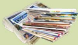
newspapers and magazines