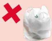
plastic bags (full or empty)