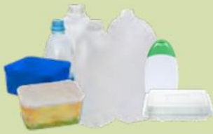
plastic containers* numbers 1, 2 and 5