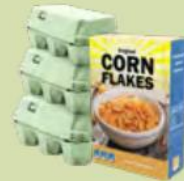
egg cartons and cereal boxes

*Only plastics 1, 2 and 5 are accepted and recycled through Auckland Council's kerbside recycling collection.