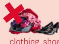
clothing, shoes and bedding