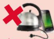
electronic and electrical items