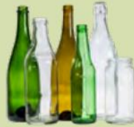
glass bottles and jars