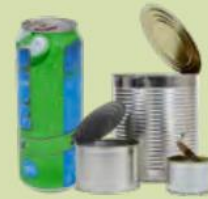
steel, aluminium, and tin cans