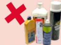
hazardous waste, chemicals and empty aerosol cans