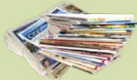
newspapers and magazines