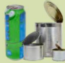
steel, aluminium, and tin cans