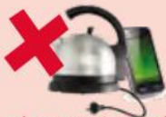
electronic and electrical items